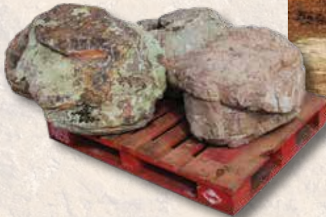
Cascade Mountain Medium Boulder 145101