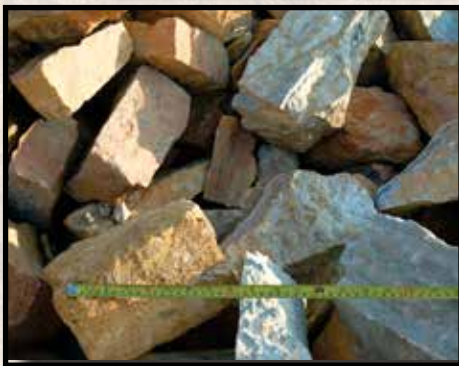
Decorative Rip Rap 4" - 10" thick #31161