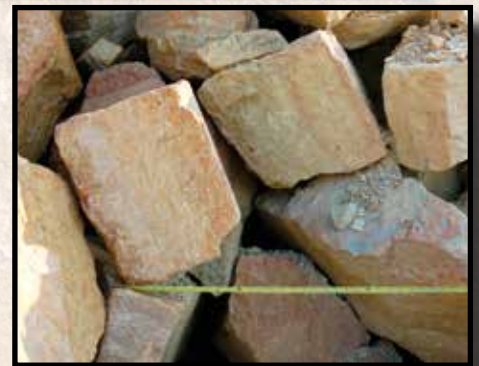
Accent Chunks 16" - 32" thick #31163

Bagged product can ship with other palletized products for maximum profitability!