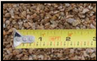
Extra Small #55101