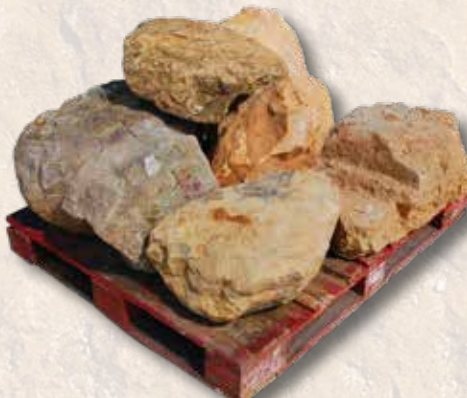
Catawba Sunrise Medium Boulder 155101