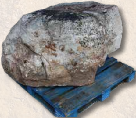
Cascade Mountain Large Boulder 145101