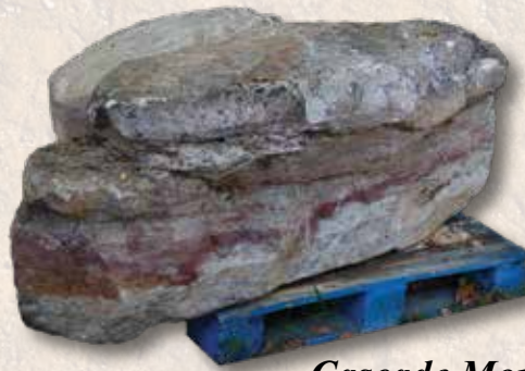
Cascade Mountain Extra Large Boulder 145101