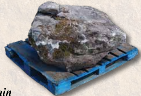
Cascade Mountain Large Boulder 145101