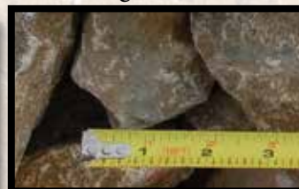
Extra Large #55105

Medium (3/16" - 1" diameter not shown) #55103