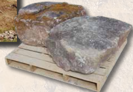
Cascade Mountain Medium Boulder 145101