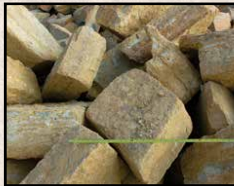
Accent Chunks 8" - 20" thick #31162