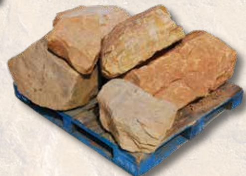
Catawba Sunrise Medium Boulder 155101

Combine all items on this page for Full Loads!